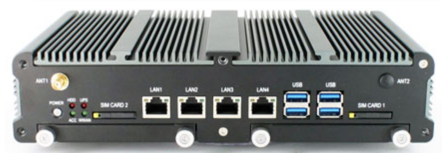
Support: Device Specification | CAN-BUS Manual [EN] | Drivers (CAN-BUS) | Drivers (Windows) | Manual [EN] | Drivers (WinXP)

The FleetPC-8 Car-PC series offers high performance and maximum connectivity. The 4x LAN ports and dual hot-swappable 2.5" drive bays (RAID 0/1 support) and internal SATA DOM module connector, the system is for example perfect for digital IP video recording applications (police, etc.). The FleetPC-8-VID model in addition is equipped with a four-channel analog video card.